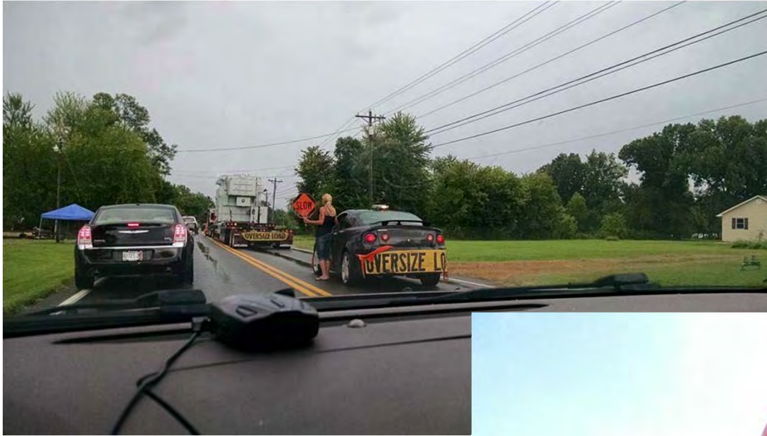
Left: How not to do Traffic Control