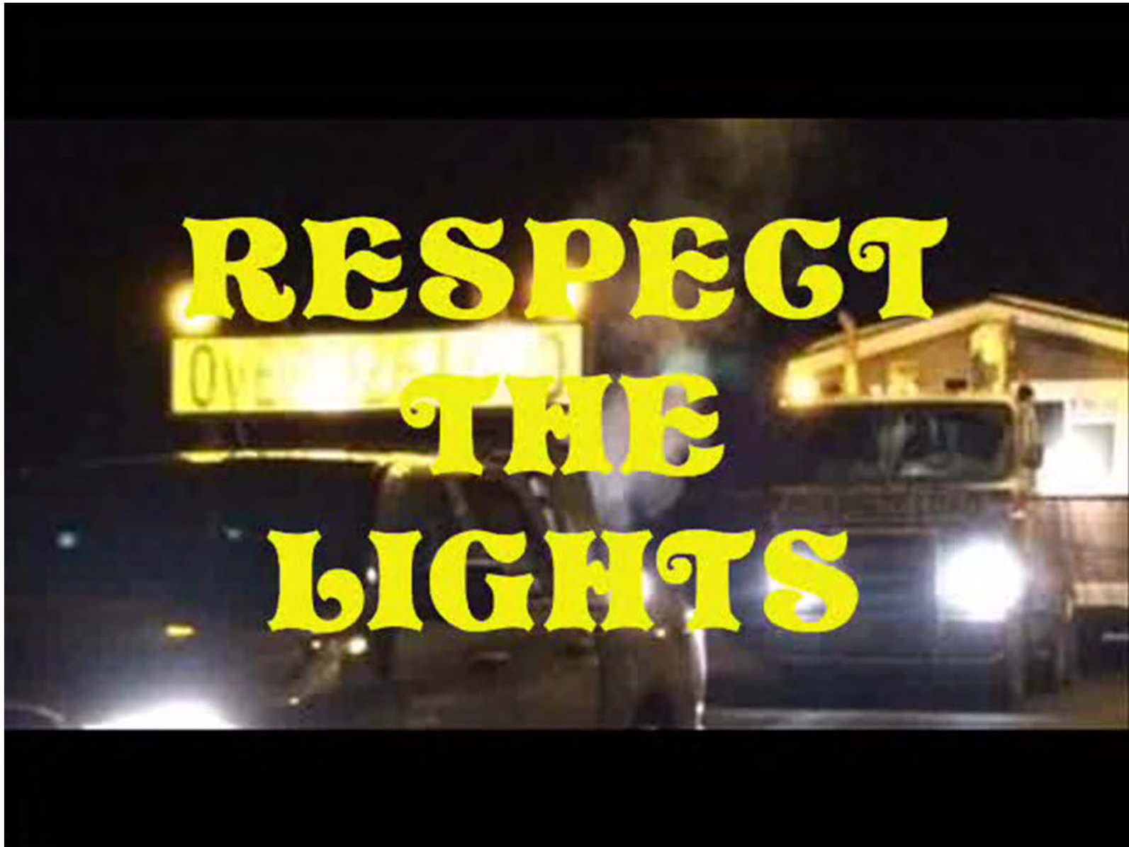
Video – Respect The Lights