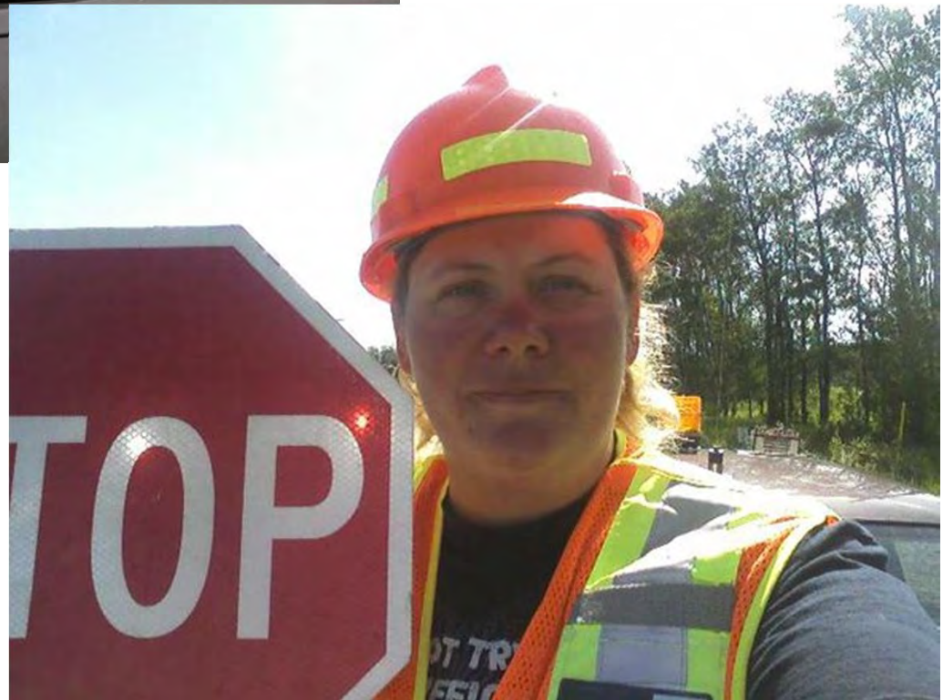
Right: Reflective Clothing and Equipment